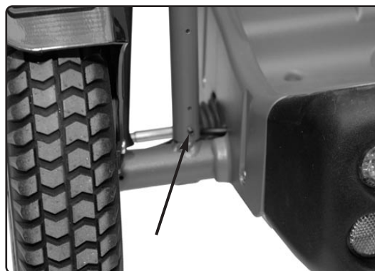
Fig. 2. Placing of stopscrew.