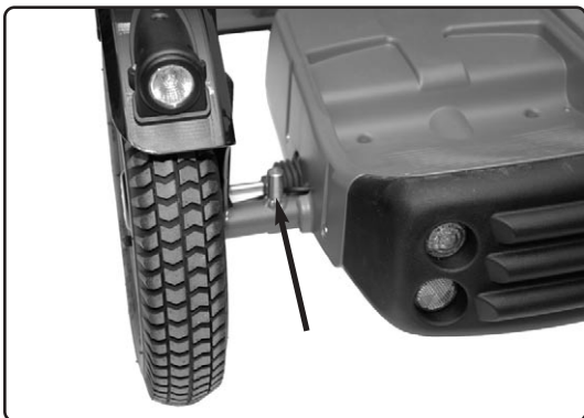
Bild 1. Tillbehörsfäste.

OBS! Stoppskruven ska vara framåt vid högermontage och bakåt vid vänstermontage.