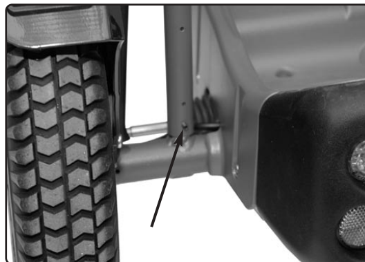
Bild 2. Stoppskruvens placering.