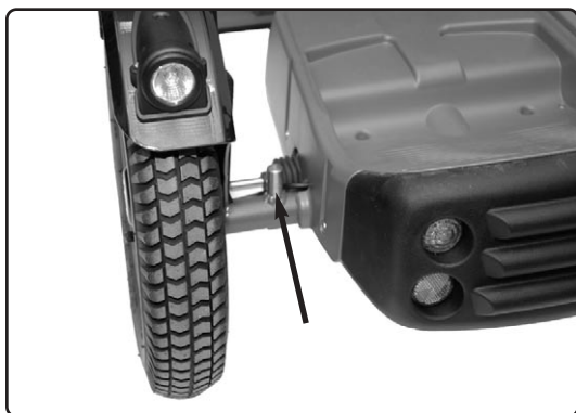
Fig. 1. Holder for accessories.

NB! The stop screw must face forwards with right-hand installation and backwards with left-hand installation.