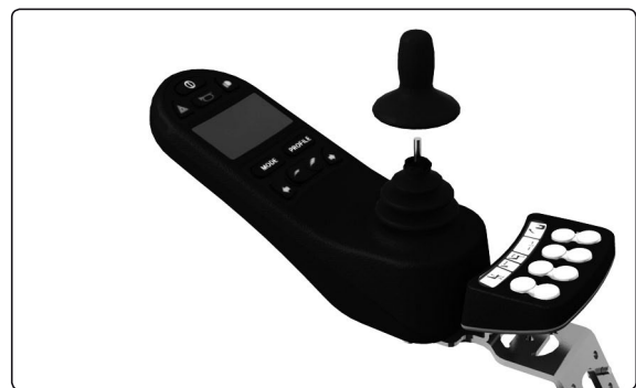
Standard-greppet demonterat .