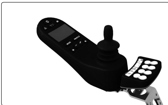
Standard-greppet monterat .