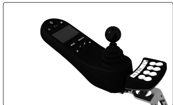
Montera alternativt grepp.